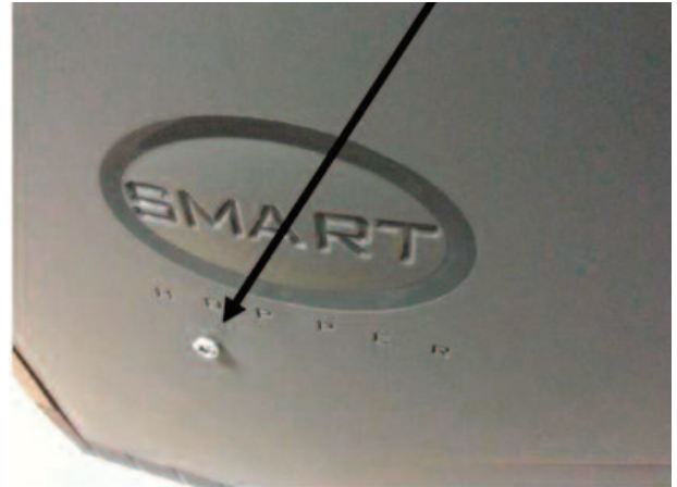
current retaining screw

As part of our continuous quality improvements, with immediate effect the retaining screw in the PM00430 left side panel of the SMART Hopper has been removed and replaced by an internal retaining clip. This change will have no anticipated impact to function, compatibility or reliability.